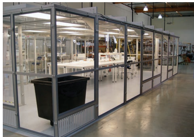
A well-organized cleanroom includes attention to process flow. Make sure furniture and equipment do not hinder air flow. Materials should come in one end and go out the other.

Every cleanroom ISO Class 7 or cleaner should have an anteroom for gowning, set off from the larger cleanroom with softwall curtains at least. This keeps street dirt from getting into the clean area. Interior isolation is also important in food processing and pharmaceuticals to prevent cross-contamination. A recent Simplex project called for dividers for a vitamin processing operation. If vitamin B12 meanders into the Vitamin C work area, that's cross-contamination—a huge problem. Cross contamination can mean manufacturing shutdowns and product recalls and lost profits.