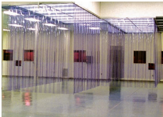
This enclosure is in As Built state, before equipment and materials are moved in. Notice that it is within an existing room and takes advantage of the air conditioning infrastructure that is already installed. Cleanrooms are certified by the manufacturer in an As Built state.

These environments are prevalent in micro-electronics and will play a big part in nanotechnology as we get more involved in that industry. At these levels it is very important that you consult with a knowledgeable expert.