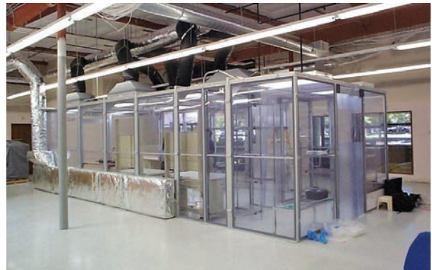
Rather than ceiling plenums and air chases in the walls, this room uses an elaborate system of ducting to recirculate air leaving the room, and bringing it back in through the ceiling to pass through the HEPA filters before re-entering the room. The gowning area on the right end of the room provides technicians a place to gown before entering the main cleanroom, reducing the risk of contamination.

It pays to bring in an expert early in the planning process. They can help you troubleshoot airflow problems, the types of testing procedures you must employ, and how to develop cleanroom protocols. A knowledgeable professional will point out things you will not even consider.