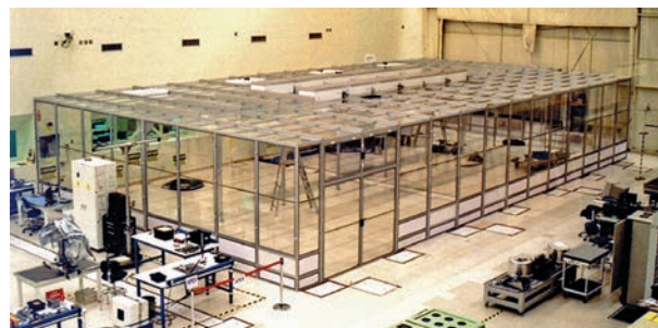
Modular cleanrooms as large as 5,000 square feet, and even larger, are often required for assembly lines, packaging operations and other environments.

Another advantage to a modular cleanroom is in its tax benefits. A modular cleanroom can be written off in seven years. An existing room within your facility that is transformed into a cleanroom—referred to as “stick-built”—has to be written off over a much longer period of time.