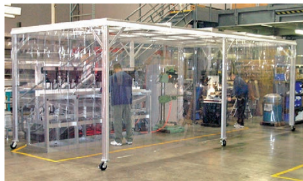
This modular enclosure can be moved throughout a factory to contain specific processes that require a higher degree of protection against contamination. Cleanrooms and enclosures should be in place and the HEPA filters operating for 24 hours to insure proper levels.